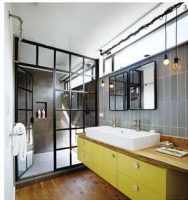
Info Location: San Francisco (美國三藩市) Size: 2,100 sq. ft.