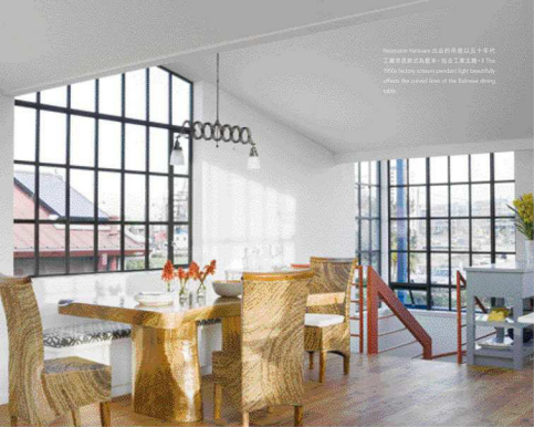
Recreation Hardware 出品的吊燈以五十年代的工業吊燈款式為藍本，結合工業風格，以 The 700s factory recessed pendant light beautifully reflects the curved lines of the Belmont dining table.