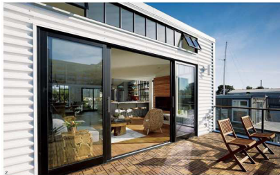
2. 樓上的露台是曬日光浴的理想地點。拉開門即可連接室內外空間。The second floor living and dining area opens out onto a sunny deck overlooking Mission Creek and San Francisco.