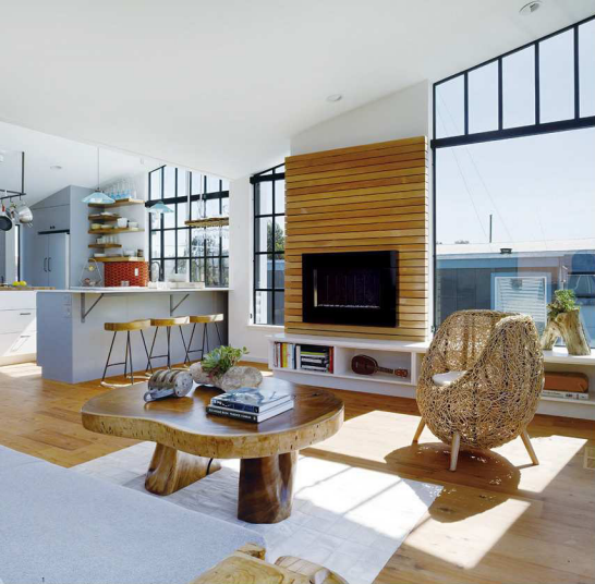
1. 茶几和邊台家人椅都取自屋頂的 Pure Sapiin 紅木。椅靠背用白特色。Custom-made in Bali, the unique coffee table and egg chair reflect the natural wood throughout.